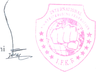
President Dr.Arash Es'haghi

International Fight Kickboxing Federation Party 2